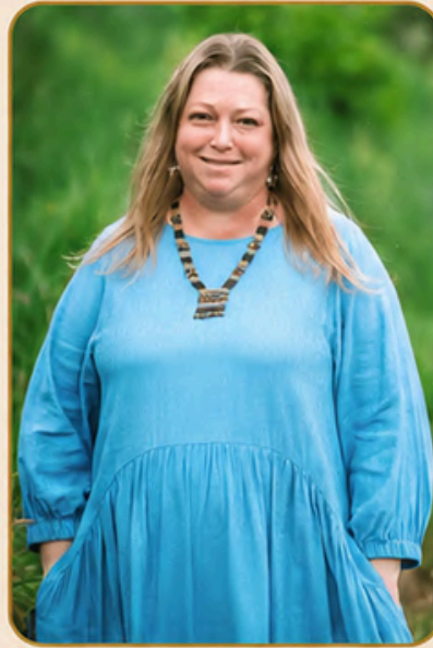
Charlie Maddox Cups, Trophies and Awards